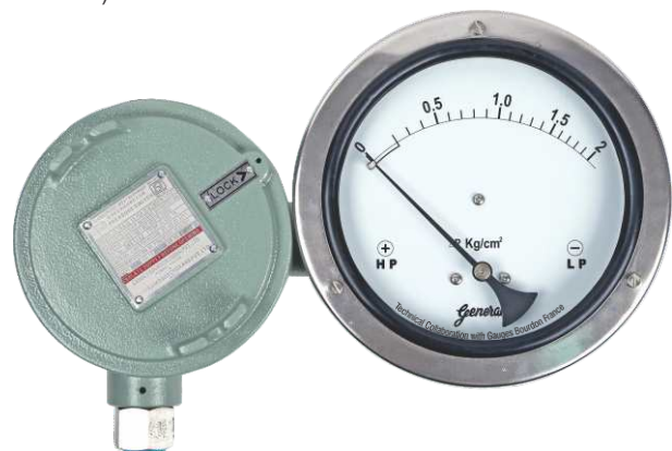
DP Gauge with Micro Switch

The parameters mentioned here are the standard specifications / values generally used for most of the process applications. Any other specification not appearing here also can be provided as per customer requirement.