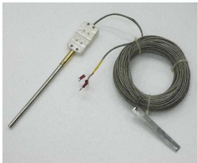
RTD Assembly with plug and jack connector