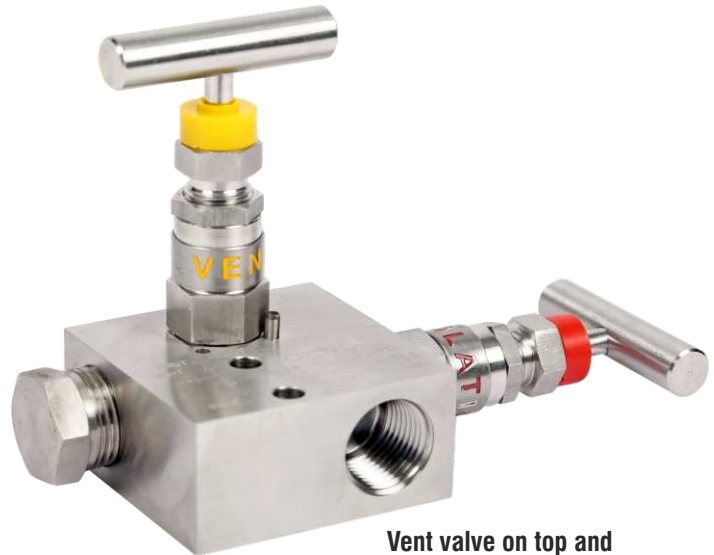
Vent valve on top and isolation valve on side

Two valve manifold is designed in a single block with female screwed inlet and outlet port combining isolation valve and calibration / vent valve. Generally used on static pressure transmitters, switches or gauges.